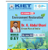
Environment Day Poster.jpeg 239K

ASHISH KARNWAL <ashish.karnwal@kiet.edu> To: me2year_a@kiet.edu, me2year_b@kiet.edu, me2year_c@kiet.edu, me3year_a@kiet.edu, me3year_b@kiet.edu, me3year_c@kiet.edu, me3year_e@kiet.edu, me3year_d@kiet.edu, me4year_a@kiet.edu, me4year_b@kiet.edu, me4year_c@kiet.edu, me_faculty@kiet.edu