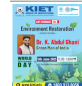
Environment Day Poster.jpeg 239K

Shaping Young Minds with Skill Oriented &amp; Value Based Education.