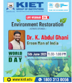
Environment Day Poster.jpeg 239K

This email contains confidential information intended for the use of the addressee named above. If you are not the intended recipient you are hereby notified that any use, dissemination, distribution or reproduction of this email or the contained information is strictly prohibited by law. If you have received this email in error, please delete and destroy all copies and notify KIET Group of Institutions by telephone or by replying to the sender. Except as required by law, KIET Group of Institutions does not represent, warrant and/or guarantee that the integrity of this email has been maintained nor that the communication is free of errors, virus, interception or interference. You may not rely on this message as advice to act unless subsequently confirmed by fax or letter signed by an authorized representative of KIET Group of Institutions.